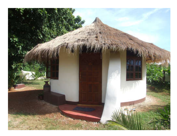
step 18: Final Earthbag Roundhouse Video

background research and maybe start out by building a small storage shed to refine your techniques. Almost everything you need to know is free on our websites.